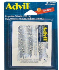
ADVIL 2-PACK SELECT ONE BOX