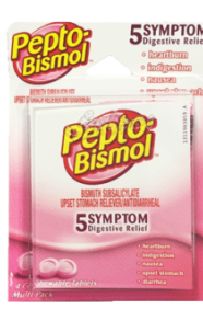
PEPTO-BISMOL SELECT ONE 2PK CHEWABLE TABLETS