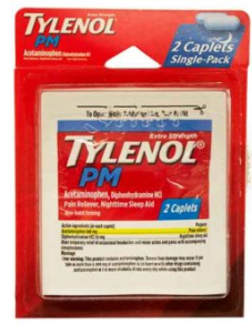
TYLENOL PM 2-PACK SELECT ONE BOX