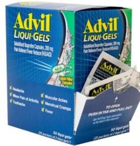
ADVIL LIQUID GELS 2-PACK 25CT DISPENSER BOX SKU: 20-025ALG Price: