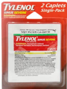
TYLENOL SINUS SEVERE SELECT ONE 2- PACK DISPENSER BOX