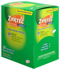
ZYRTEC 1PK DISPENSER BOX SKU: 20-020ZY Price: