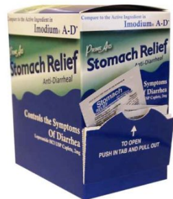
PRIME AID STOMACH RELIEF 2-PACK 36CT DISPENSER BOX