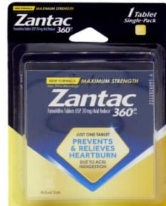
ZANTAC 360 1-PACK SELECT ONE BOX