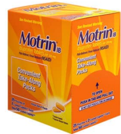
MOTRIN 2-PACK DISPENSER BOX SKU: 20-025MO Price: