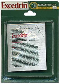
EXCEDRIN 2-PACK SELECT ONE BOX