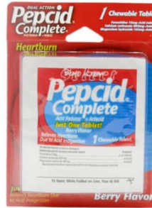
PEPCID COMPLETE BERRY SELECT ONE 1PK CHEWABLE