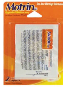
MOTRIN 2-PACK SELECT ONE BOX