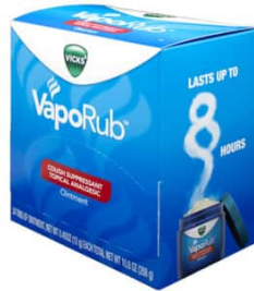
VICKS VAPO RUB 0.45OZ TINS DISPENSER BOX SKU: 20-024VV Price: