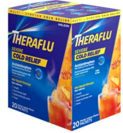
THERAFLU DAYTIME 1PK DISPENSER BOX SKU: 20-020TD Price: