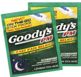
GOODY'S PM SLEEP AID 6-PACK POWDER STICKS