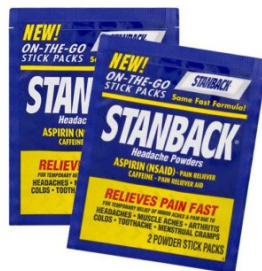
STANBACK PAIN RELIEVER 2-PACK POWDERS