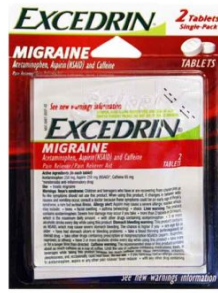
EXCEDRIN MIGRAINE 2-PACK SELECT ONE BOX