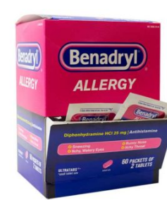
BENADRYL 2-PACK 60CT DISPENSER BOX