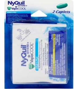
NYQUIL SEVERE 2- PACK SELECT ONE BOX