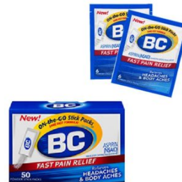
BC HEADACHE 6-PACK POWDERS DISPLAY