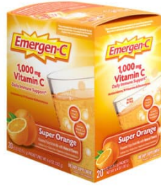
EMERGEN-C 1PK DISPENSER BOX SKU: 20-020EC Price: