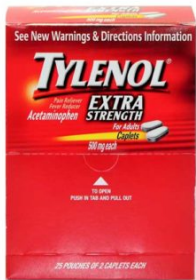
TYLENOL EXTRA STRENGTH 2-CAPLETS DISPENSER BOX SKU: 20-025EST Price: