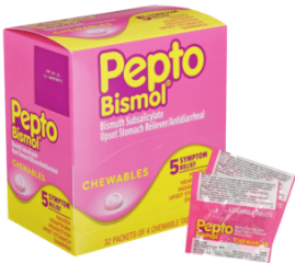
PEPTO-BISMOL 5 SYMPTOM DIGESTIVE RELIEF CHEWABLE TABLETS