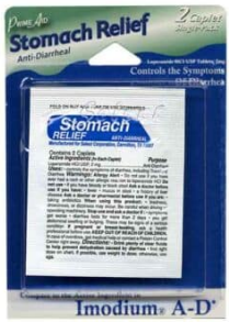
PRIME AID STOMACH RELIEF 2-PACK SELECT ONE BOX