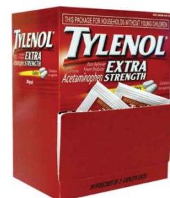
EXTRA STRENGTH TYLENOL 2-PACK