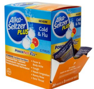
ALKA SELTZER PLUS 2-PACK 30CT DISPENSER BOX SKU: 20-030ASP Price: