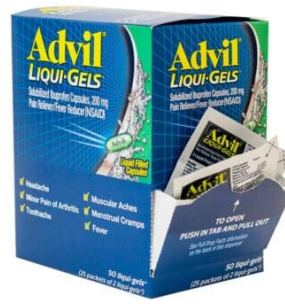
ADVIL LIQUID GELS 2-PACK 25CT DISPENSER BOX SKU: 20-025ALG Price: