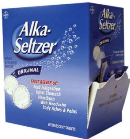
ALKA SELTZER 2-PACK 50CT DISPENSER BOX