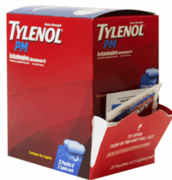
TYLENOL PM 2PK DISPENSER BOX SKU: 20-025TPM Price: