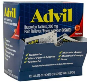
ADVIL 2-PACK DISPENSER BOX 50CT