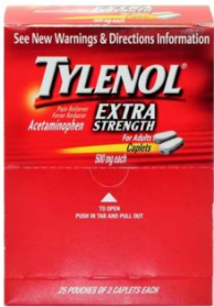
TYLENOL EXTRA STRENGTH 2-CAPLETS DISPENSER BOX SKU: 20-025EST Price: