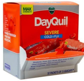
DAYQUIL SEVERE COLD & FLU DAYTIME RELIEF 32 PACKET LIQUICAPS