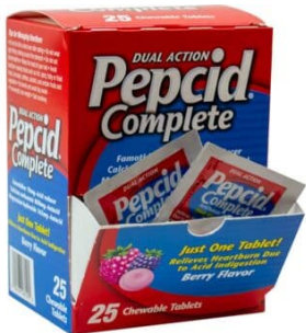
PEPCID COMPLETE 1-PACK BERRY CHEWABLES SKU: 20-025PC-C Price: