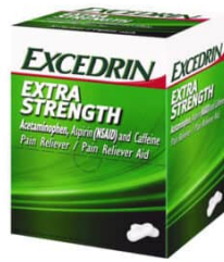
EXCEDRIN 2-PACK 25CT DISPENSER BOX SKU: 20-025EX Price: