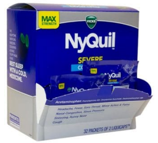
NYQUIL SEVERE COLD & FLU NIGHTTIME RELIEF 32 PACKET LIQUICAPS