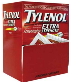
EXTRA STRENGTH TYLENOL 2-PACK DISPENSER BOX 50CT