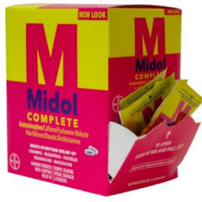
MIDOL 2-PACK 30CT DISPENSER BOX