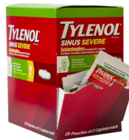
TYLENOL SINUS SEVERE DISPENSER BOX SKU: 20-025TS Price: