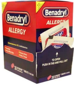
BENADRYL 2-PK DISPENSER BOX