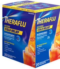
THERAFLU DAYTIME 1PK DISPENSER BOX SKU: 20-020TD Price: