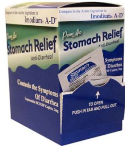
PRIME AID STOMACH RELIEF 2-PACK 36CT DISPENSER BOX