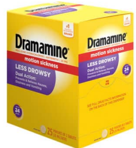
DRAMAMINE 2-PACK 25CT DISPENSER BOX