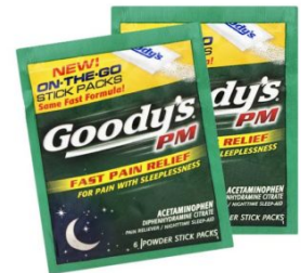
GOODY'S PM SLEEP AID 6-PACK POWDER STICKS