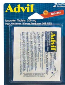
ADVIL 2-PACK SELECT ONE BOX