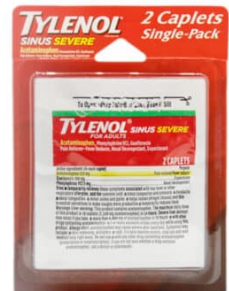
TYLENOL SINUS SEVERE SELECT ONE 2- PACK DISPENSER BOX