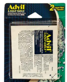
ADVIL LIQUID GELS 2-PACK SELECT ONE