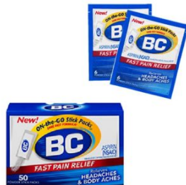
BC HEADACHE 6-PACK POWDERS DISPLAY