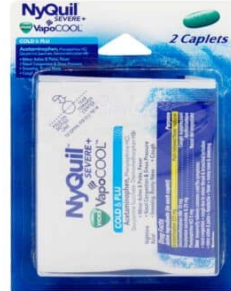
NYQUIL SEVERE 2- PACK SELECT ONE BOX