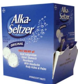
ALKA SELTZER 2-PACK 50CT DISPENSER BOX