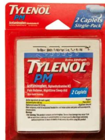
TYLENOL PM 2-PACK SELECT ONE BOX