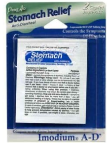
PRIME AID STOMACH RELIEF 2-PACK SELECT ONE BOX