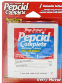
PEPCID COMPLETE BERRY SELECT ONE 1PK CHEWABLE