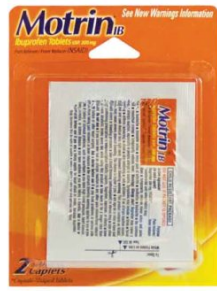
MOTRIN 2-PACK SELECT ONE BOX