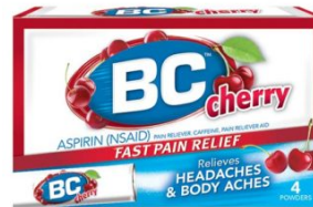
BC CHERRY 4-PACK POWDER STICKS