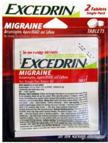
EXCEDRIN MIGRAINE 2-PACK SELECT ONE BOX