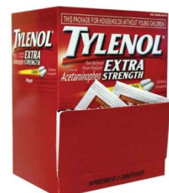
EXTRA STRENGTH TYLENOL 2-PACK