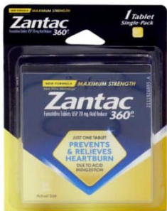
ZANTAC 360 1-PACK SELECT ONE BOX