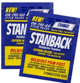
STANBACK PAIN RELIEVER 2-PACK POWDERS