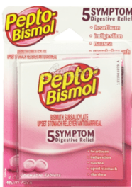
PEPTO-BISMOL SELECT ONE 2PK CHEWABLE TABLETS