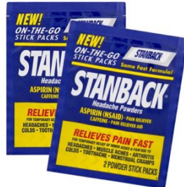
STANBACK PAIN RELIEVER 2-PACK POWDERS