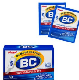
BC HEADACHE 6-PACK POWDERS DISPLAY