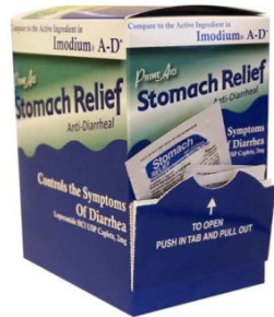
PRIME AID STOMACH RELIEF 2-PACK 36CT DISPENSER BOX