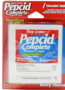
PEPCID COMPLETE BERRY SELECT ONE 1PK CHEWABLE