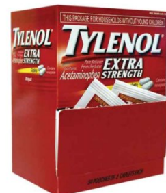
EXTRA STRENGTH TYLENOL 2-PACK