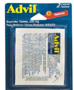
ADVIL 2-PACK SELECT ONE BOX