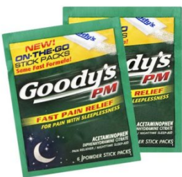
GOODY'S PM SLEEP AID 6-PACK POWDER STICKS