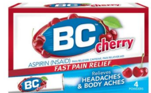
BC CHERRY 4-PACK POWDER STICKS