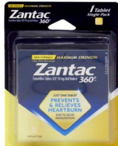
ZANTAC 360 1-PACK SELECT ONE BOX