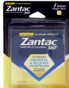
ZANTAC 360 1-PACK SELECT ONE BOX SKU: 20-261ZA Price: