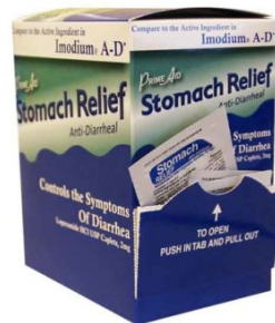
PRIME AID STOMACH RELIEF 2-PACK 36CT DISPENSER BOX