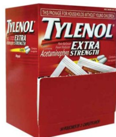
EXTRA STRENGTH TYLENOL 2-PACK