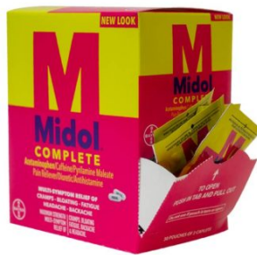
MIDOL 2-PACK 30CT DISPENSER BOX