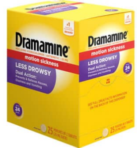
DRAMAMINE 2-PACK 25CT DISPENSER BOX