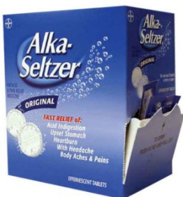
ALKA SELTZER 2-PACK 50CT DISPENSER BOX