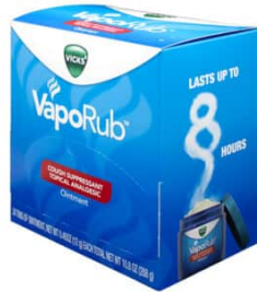
VICKS VAPO RUB 0.45OZ TINS DISPENSER BOX