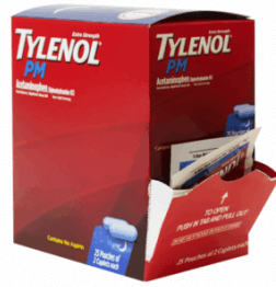
TYLENOL PM 2PK DISPENSER BOX