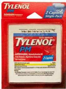
TYLENOL PM 2-PACK SELECT ONE BOX SKU: 20-261TPM Price: