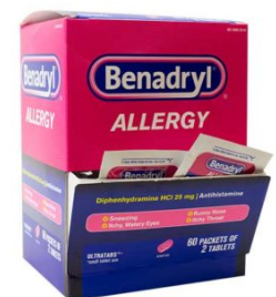
BENADRYL 2-PACK 60CT DISPENSER BOX