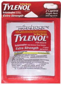
EXTRA STRENGTH TYLENOL 2-PACK SELECT ONE BOX SKU: 20-261EST Price: