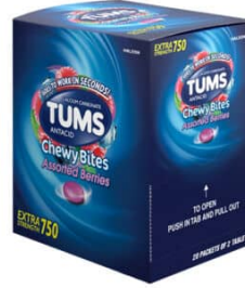
TUMS CHEWY BERRY 2PK DISPENSER BOX