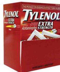
EXTRA STRENGTH TYLENOL 2-PACK