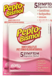
PEPTO-BISMOL SELECT ONE 2PK CHEWABLE TABLETS SKU: 20-261PB Price: