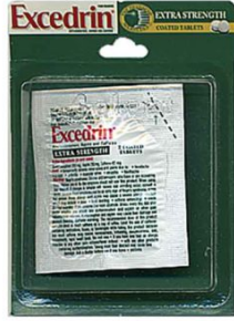
EXCEDRIN 2-PACK SELECT ONE BOX SKU: 20-261EX Price: