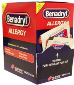
BENADRYL 2-PK DISPENSER BOX