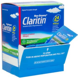
CLARITIN 24HR NON-DROWSY 1-PACK DISPENSER BOX