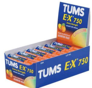
TUMS EXTRA STRENGTH ASSORTED FRUIT ROLLS SKU: 20-300EXFR Price: