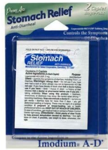
PRIME AID STOMACH RELIEF 2-PACK SELECT ONE BOX SKU: 20-261PA-IM Price: