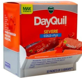
DAYQUIL SEVERE COLD & FLU DAYTIME RELIEF 32 PACKET LIQUICAPS