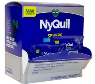
NYQUIL SEVERE COLD & FLU NIGHTTIME RELIEF 32 PACKET LIQUICAPS