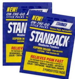
STANBACK PAIN RELIEVER 2-PACK POWDERS SKU: 20-287ST-2 Price: