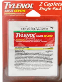
TYLENOL SINUS SEVERE SELECT ONE 2- PACK DISPENSER BOX SKU: 20-261TSS Price: