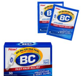
BC HEADACHE 6-PACK POWDERS DISPLAY SKU: 20-285BC-6 Price: