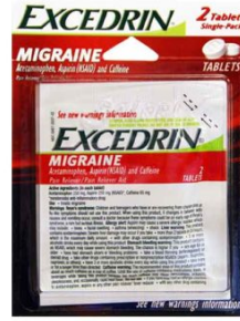
EXCEDRIN MIGRAINE 2-PACK SELECT ONE BOX SKU: 20-261EX-M Price: