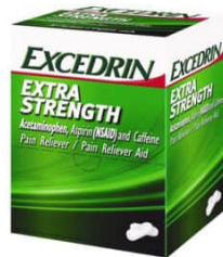
EXCEDRIN 2-PACK 25CT DISPENSER BOX