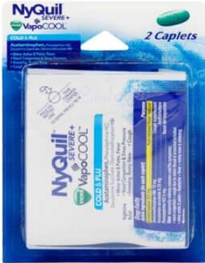
NYQUIL SEVERE 2- PACK SELECT ONE BOX SKU: 20-261NYS Price: