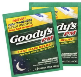
GOODY'S PM SLEEP AID 6-PACK POWDER STICKS SKU: 20-286GPM Price: