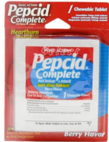
PEPCID COMPLETE BERRY SELECT ONE 1PK CHEWABLE SKU: 20-261PC Price: