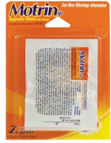
MOTRIN 2-PACK SELECT ONE BOX SKU: 20-261MO Price: