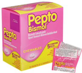
PEPTO-BISMOL 5 SYMPTOM DIGESTIVE RELIEF CHEWABLE TABLETS