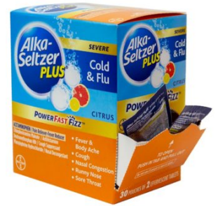
ALKA SELTZER PLUS 2-PACK 30CT DISPENSER BOX