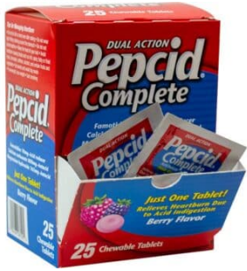
PEPCID COMPLETE 1-PACK BERRY CHEWABLES