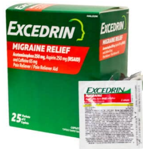
EXCEDRIN MIGRAINE 2-PACK 25CT DISPENSER BOX