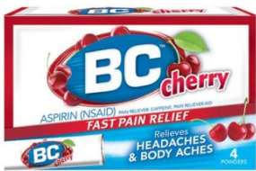
BC CHERRY 4-PACK POWDER STICKS SKU: 20-285BCC Price: