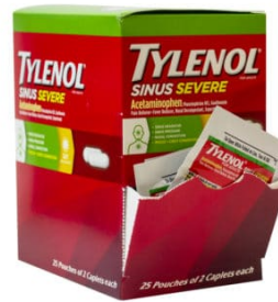
TYLENOL SINUS SEVERE DISPENSER BOX